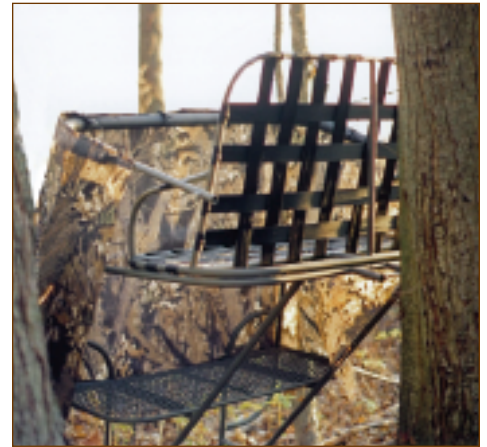
An optional camouflage skirt is available for the Family Tradition Double Ladder Stand. It's a smart addition that will keep you hidden.